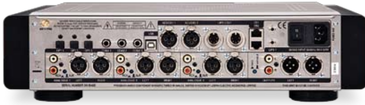
ABOVE: The Libra has 12 digital inputs: Bluetooth, USB, 2x AES/EBU (XLR), 2x I 2 S (RJ45) and six S/PDIF (3x RCA and 3x Toslink optical). It has three analogue ins on RCA and balanced XLR connections plus single-ended (RCA) and balanced XLR outputs

especially left to right, although it dropped back a long way as well. The Libra shows no favouritism towards any specific musical genre. The sparse electronic sounds of Kraftwerk's 'Techno Pop' [ Electric Café – CDP564-7 46420 2] was exposed for all to hear, yet it never grated. It was crystal-clear and well-etched, yet it didn't sound as if the Leema was doing a forensic investigation at a crime scene – instead it preferred to get into the swing of things and enjoy the track's sinuous rhythms.