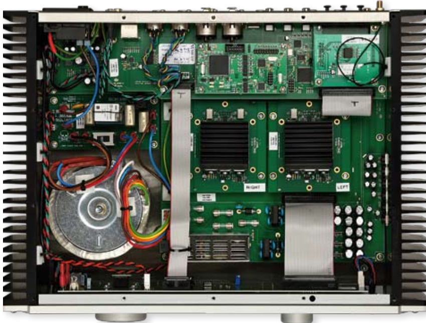
RIGHT: A linear PSU feeds proprietary fully balanced 'Quattro Infinity' dual-mono DAC modules [see boxout, p61] and the Thesycon driver-based 'M1' USB module. The Bluetooth can be seen top right of this picture

Leema's large LC display also allows the user to configure a number of settings. One press of the menu button calls up the 'basic settings' menu where you can set absolute phase, define the analogue filter bandwidth and the LCD brightness, as well as configure the CD and home theatre inputs, and cause the unit to drop the